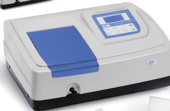
"V-1100" Part no. 4120025