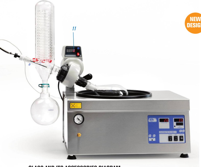
GLASS AND ITS ACCESSORIES DIAGRAM SPARE PARTS

ACCESSORY Silicone oil 4 liters. Temperature up to 300°C. Viscosity 50 mm<sub>2</sub>/s at 25 °C. Melting point 318 °C. Part No. 1000027