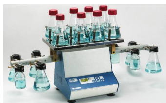
Model Vibromatic with adapter platform.