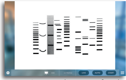
Inverse your image at your fingertips