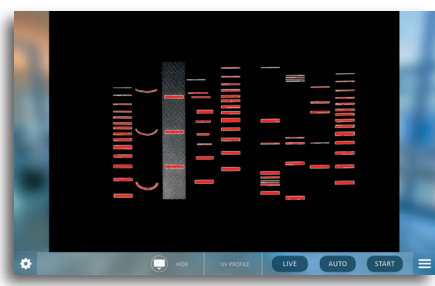
Visualize the saturation in live