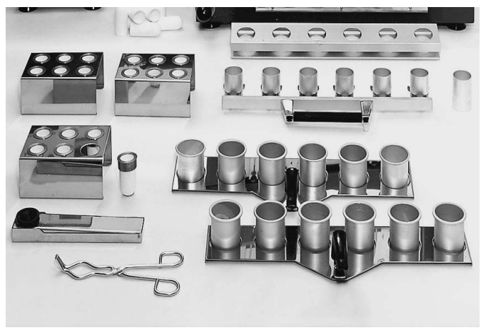
Accessories supplied with the 6 place model.