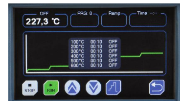
Temperature ramps graph